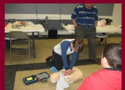
Emergency First Aid