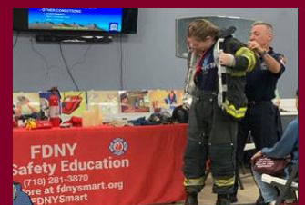
NYFD Fire Safety